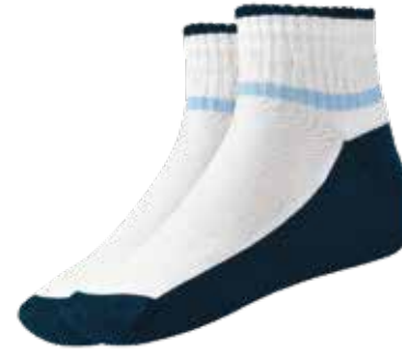
2513074 Sport Socks