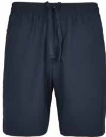
1111569 Microfibre Shorts