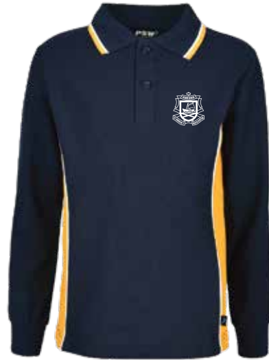
1110180 L/S Polo