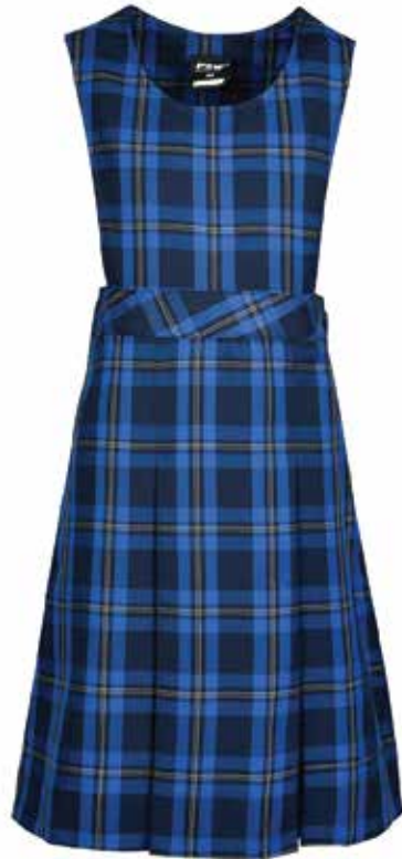
1104002 Box Pleat Tunic