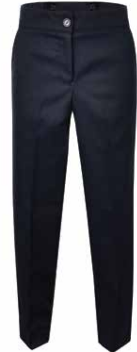
1118089 Tailored Pants