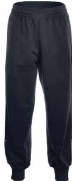
1110737 Zip Cuff Trackpants