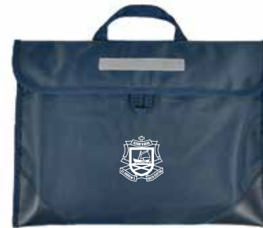
8300396 Primary Pete Bookbag