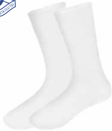
2511050 White Crew Socks