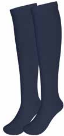
2512000 Turnover Knee Hi Socks