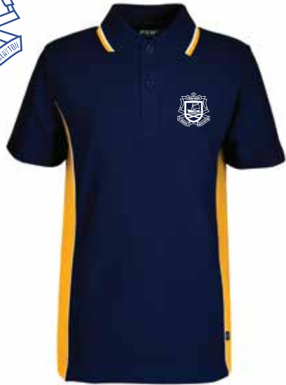
1110130 S/S Polo