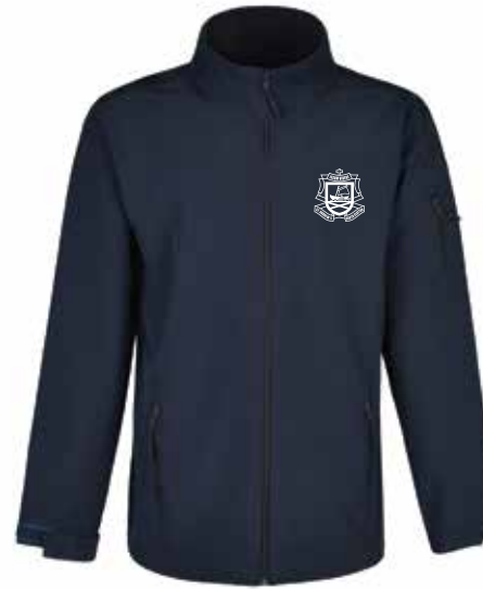
1100950 Soft Shell Jacket