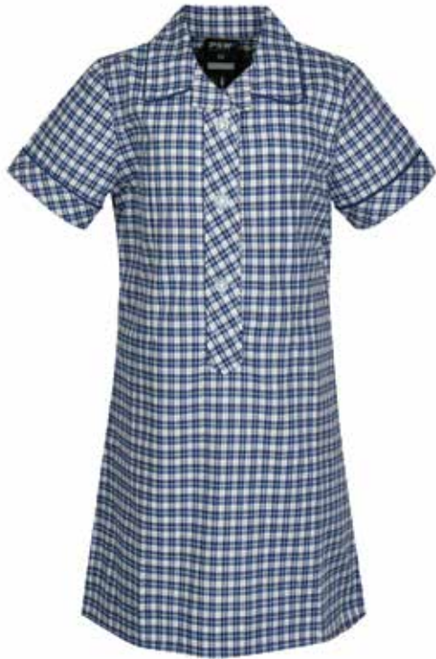
1100942 Summer Dress