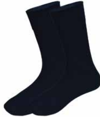
2511050 Navy Crew Socks