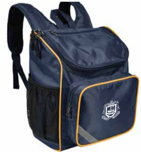
8302200 Explorer Bag