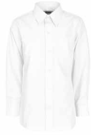
1101055 L/S Shirt