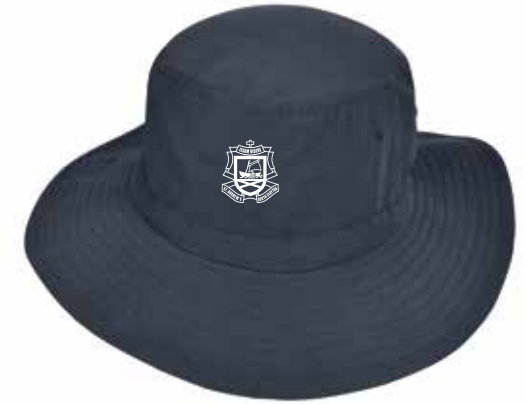
1110797 Microfibre Hat