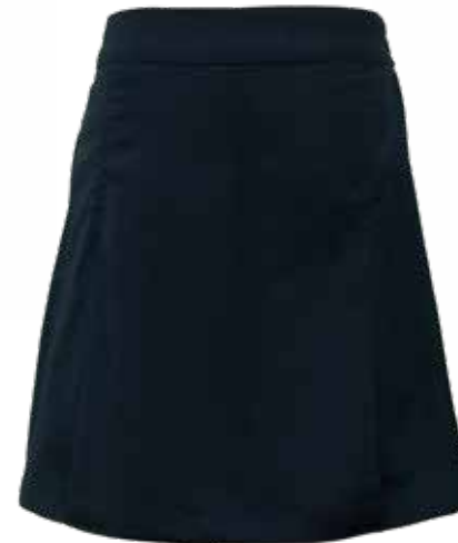
1101364 Scooter Skort