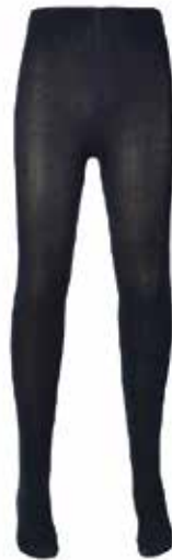
2513000 Girls Tights