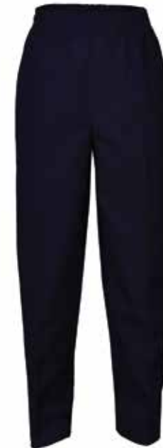
1110400 Elastic Waist Pants